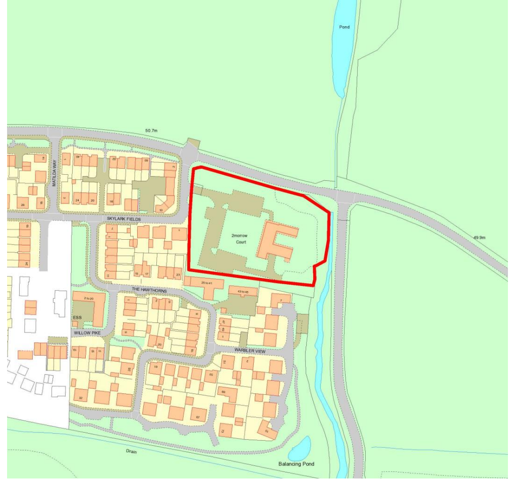
Figure 1: Site Location Plan.