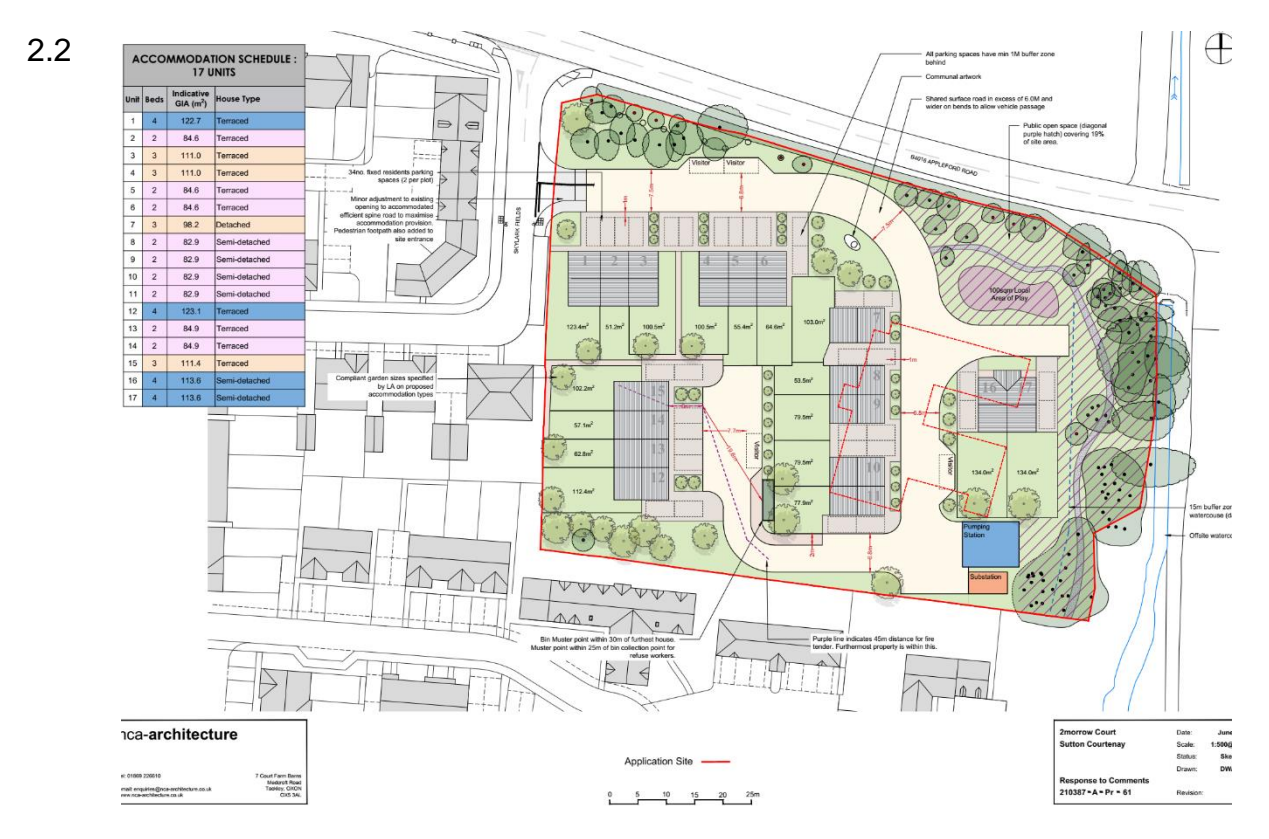
Figure 3: Indicative site layout.

2.3 The proposed housing mix is as follows: